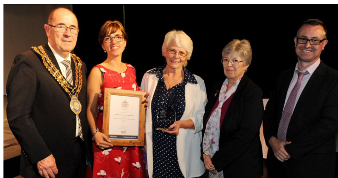
Our representatives receiving the award.